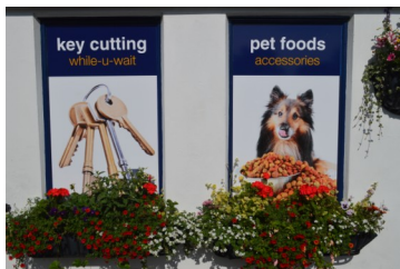
Last year we planted up the shop front.

Home delivery service available on purchases over £15.00. Deliveries to Brundall, Postwick, Blofield, Blofield Heath, Strumpshaw and Lingwood. Deliveries at a mutually convenient time. Deliveries will not take place in icy conditions.