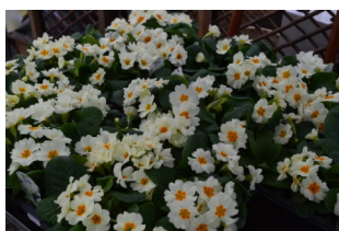
Primrose Giveaway 14th February 2015

The very first item of stock we purchased and put on sale on the 14th February 2005 was 4 trays of primroses. We have enjoyed selling plants ever since.