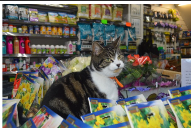
Tilly endorses the Go-Cat

Home delivery service available on purchases over £15.00. Deliveries to Brundall, Postwick, Blofield, Blofield Heath, Strumpshaw and Lingwood. Deliveries at a mutually convenient time. Deliveries will not take place in icy conditions.