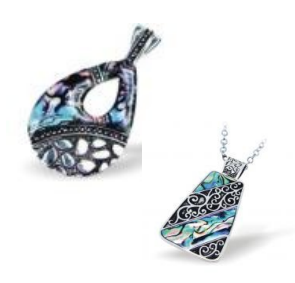
Paua shell collection

that awkward size bar which can easily drop out of your hand when you first use it.